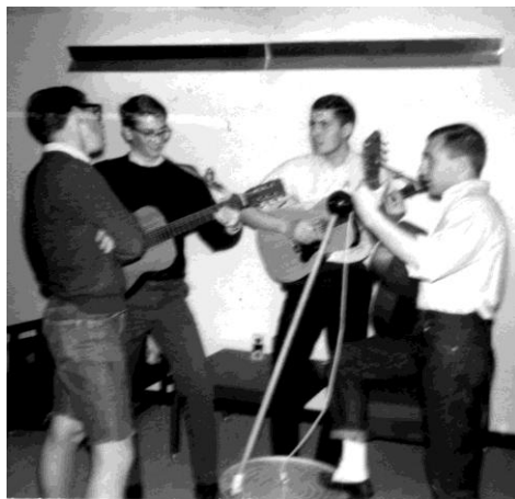
The New Overlann Four practice at Purdue dorm