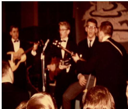
The New Overlann Four play concert at Purdue