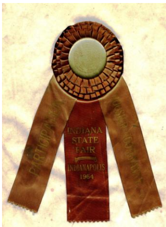
Ribbon from the 1964 Indiana State Fair Hoosier Hootenanny